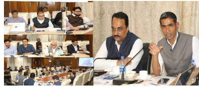
THE KASHMIR TALK BUREAU SRINAGAR:

Direct ROs to reach out to every voter for maximum participation in festival of democracy