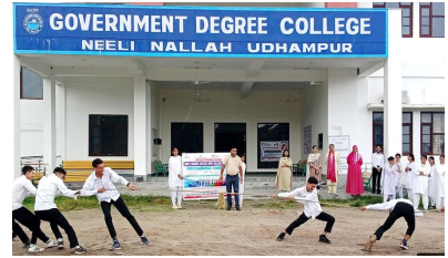
THE KASHMIR TALK BUREAU UDHAMPUR:

Under the aegis of International Youth Day, Red Ribbon Club Government Degree College Neeli Nallah, Udhampur in collaboration with J&K Aids Control Society flagged off a rally from the college premises followed by a Tug of War to mark and celebrate "National Sports Day".