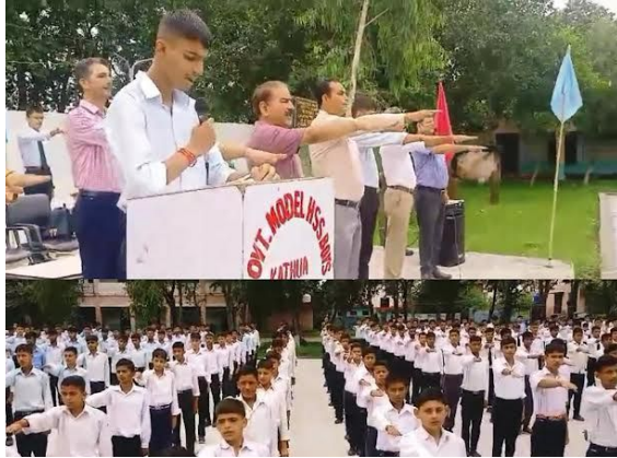
THE KASHMIR TALK BUREAU KATHUA:

As part of the ongoing efforts to bolster voter awareness and participation, multiple activities were successfully organized in the Kathua (SC)-67 Assembly Constituency under the Systematic Voters' Education and Electoral Participation (SVEEP) initiative.