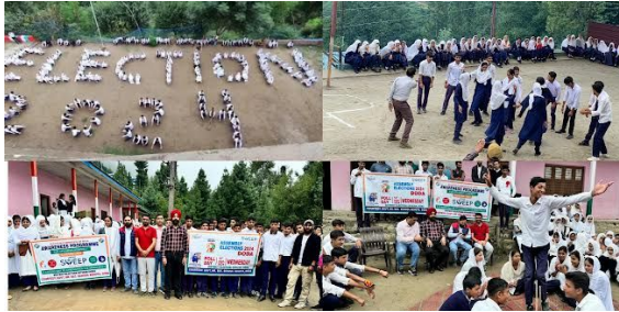
THE KASHMIR TALK BUREAU DODA:

The Systematic Voters' Education and Electoral Participation (SVEEP) Program team has adopted an innovative approach to promote electoral awareness among school students in Doda District. Cultural activities are being organised across the district, engaging young minds and