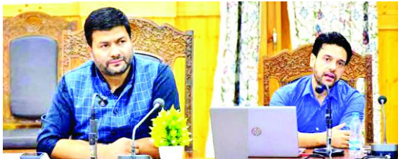
THE KASHMIR TALK BUREAU BANDIPORA:

In preparation for the General Election to the Legislative Assembly 2024, a comprehensive workshop-cum-training programme for political parties, addressing crucial aspects of the electoral process, was conducted today at the Mini Secretariat Bandipora.