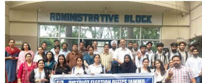
THE KASHMIR TALK BUREAU JAMMU:

In a spirited effort to boost awareness among the electorates and the participation of youth in forthcoming Jammu and Kashmir Assembly Elections 2024, the Election Department on Friday organised an awareness program at Government MAM PG College, Jammu under the Systematic Voters' Education and Electoral Participation (SVEEP).