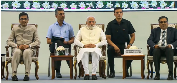
judiciary have lived up to the responsibility. Addressing the inaugural session

Modi also said the judiciary is considered a guardian of the Constitution, and that the Supreme Court and the