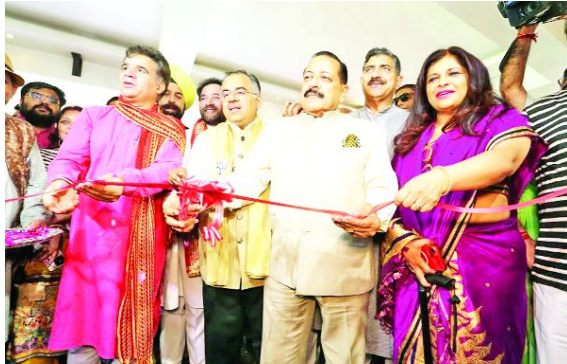
THE KASHMIR TALK BUREAU JAMMU:

In a significant move aimed at enhancing communication and outreach, the Bharatiya Janata Party (BJP) today inaugurated a Media War Room in Jammu during assembly elections in Jammu and Kashmir.