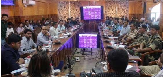
THE KASHMIR TALK BUREAU SHOPIAN:

In order to review the preparation of the District Administration for upcoming Assembly elections to Legislative Assembly, 2024, General Observer for 37- Shopian, Roohi Khan; 36- Zainapora, Jeevan Babu K; Police Observer, Ravi D Channannavar and Expenditure Observer, Nelapatla Ashok Babu today held meeting with Nodal Officers, ROs and other stakeholder departments at Mini Secretariat Shopian. These high ranking officers, deputed by Election Commission of India are on round the clock election duty in the district to ensure the smooth and peaceful