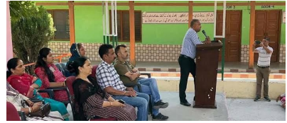
THE KASHMIR TALK BUREAU KATHUA:

To promote voter awareness and the importance of ethical voting, a pledge-taking ceremony and awareness program were conducted today at Government Higher Secondary School, Bani, under the Systematic Voters' Education and Electoral Participation (SVEEP) initiative.