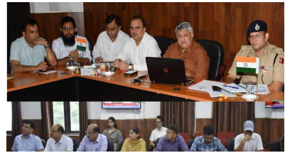
THE KASHMIR TALK BUREAU REASI: