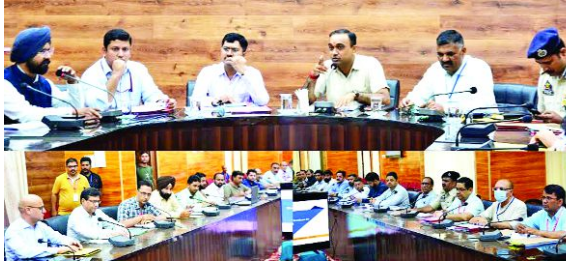
THE KASHMIR TALK BUREAU DODA: