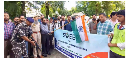
THE KASHMIR TALK BUREAU BARAMULLA:

In view of the Assembly Elections in Jammu and Kashmir, a comprehensive voter awareness program was held in Pattan today under SVEEP (Systematic Voters' Education and Electoral Participation) aimed to educate and engage the electorate, about the importance of voting and the electoral process.