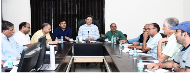
THE KASHMIR TALK BUREAU JAMMU:

Relief & Rehabilitation Commissioner (M), Dr. Arvind Karwani today chaired a meeting with Relief Organization officers and political party representatives to review preparations for the upcoming Assembly Elections-2024. Dr Karwani emphasized on ensuring all requisite Assured Minimum Facilities (AMF) at all designated Special Polling Stations viz. permanent ramps, drinking water, toilet facilities as per norms of Election Commission of India. He emphasized on