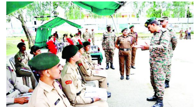
THE KASHMIR TALK BUREAU NAGROTA: