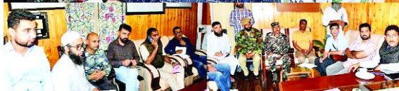
THE KASHMIR TALK BUREAU GANDERBAL: